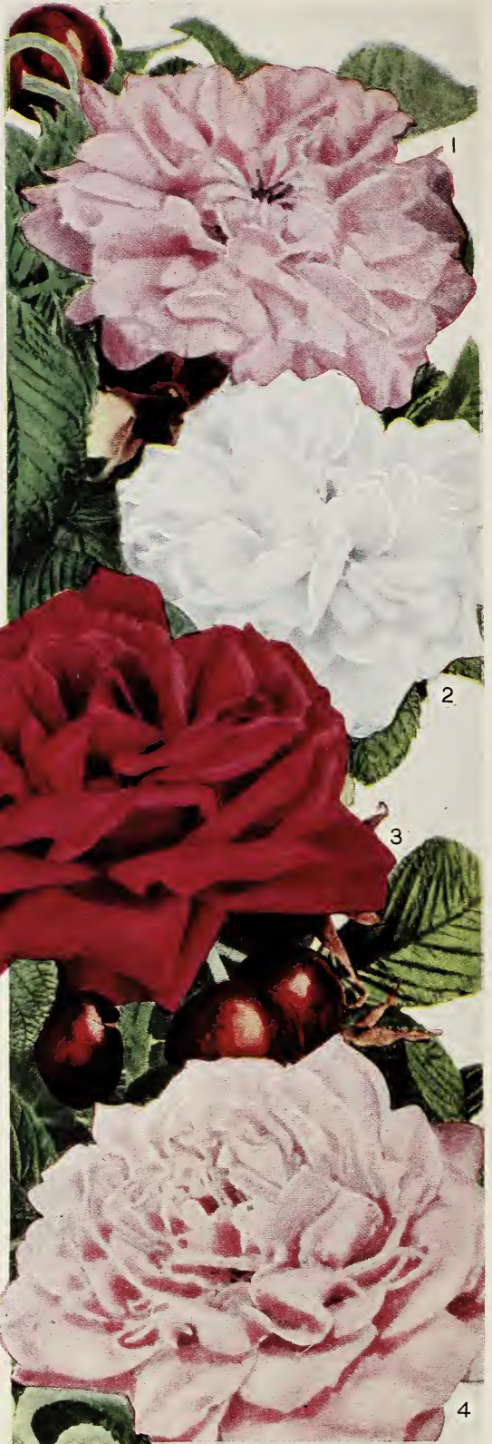
1. New Century. 3. Hansa. 2. Sir Thomas Lipton.

Price, including Roseraie de L'Hay, each, $1.50, $14.00 per 10.